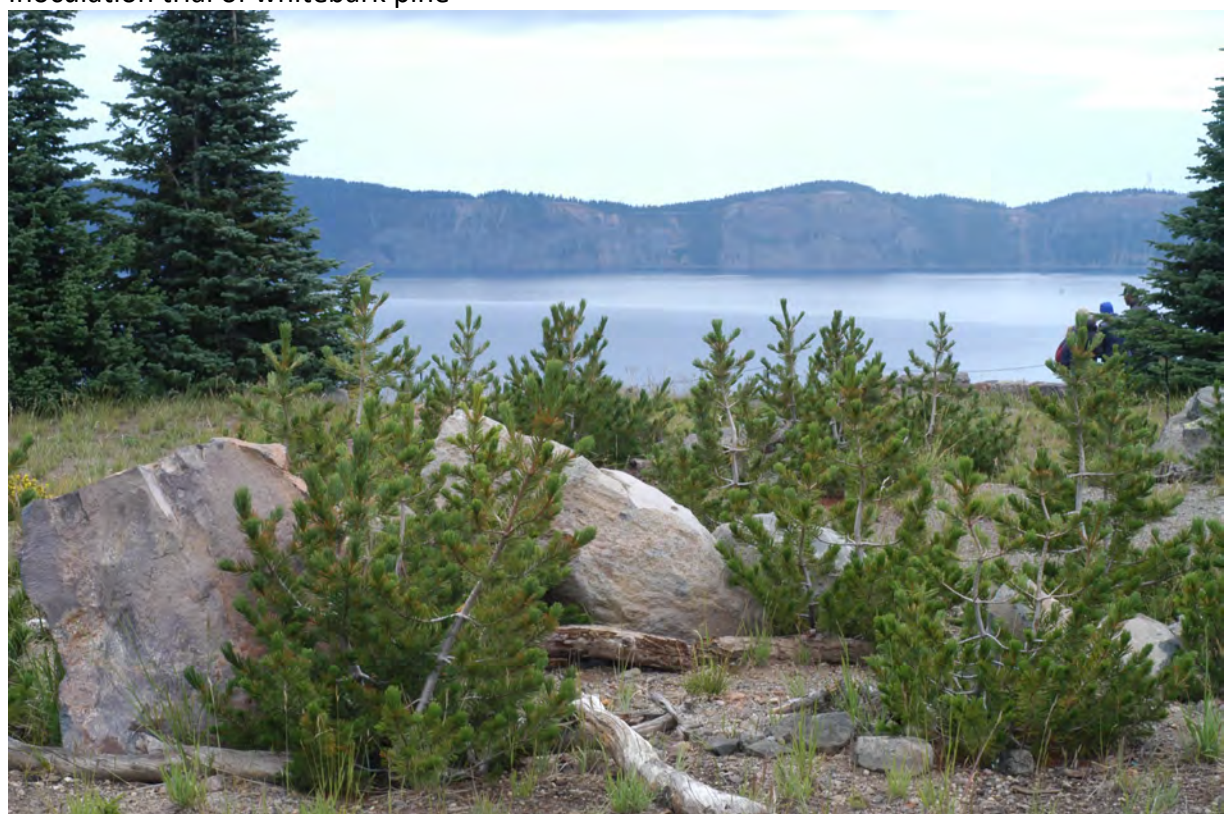
Restoration of whitebark pine ( Pinus albicaulis ) at Crater Lake National Park