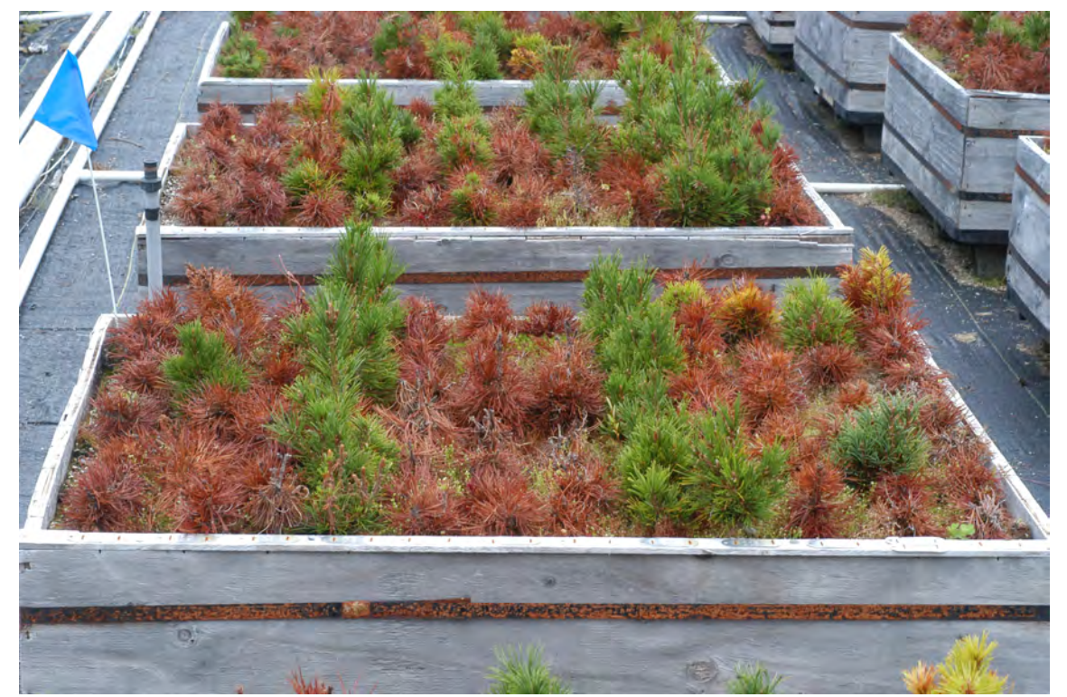
Inoculation trial of whitebark pine

Whitebark Pine – resistance to white pine blister rust and use in restoration